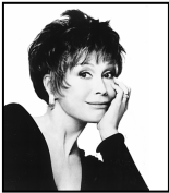
Mary Tyler Moore